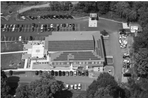
Sparta Township currently has 2 successful solar electric installations in operation including one located on the roof of Town Hall.